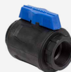
Guyco Ball Valves